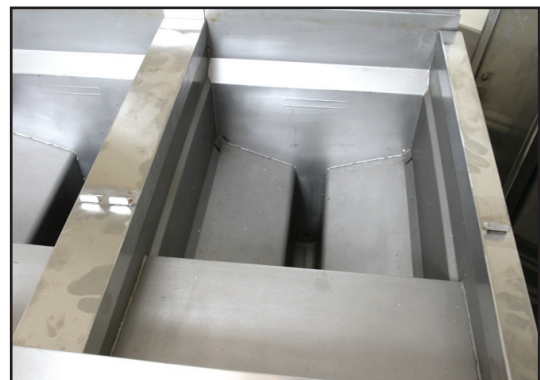
Figure 5: The new joiner strips, right and left, with a basket banger brackets are shown on the right side of the fryer.