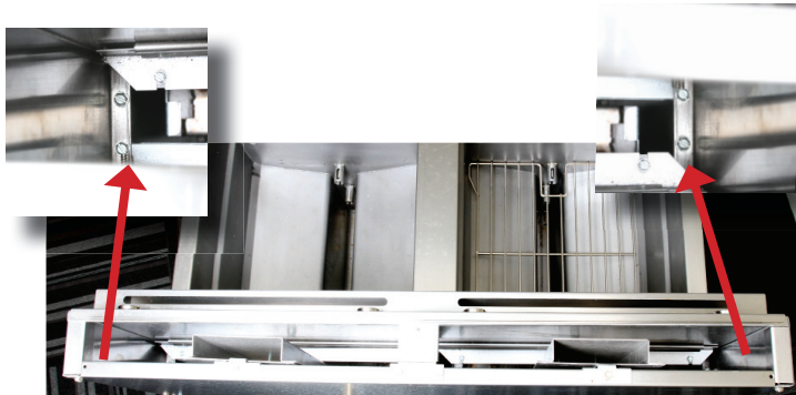
Figure 2: Remove top back panel (top) and four screws (two at each end) securing the flue. (See inset images above).

top cap by elevating the joiner strip on the opposite end. (See Figure 3 ).